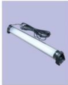
Japanese LED lighting