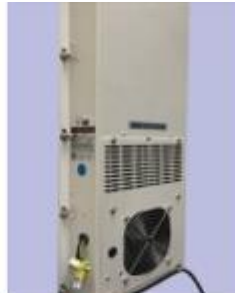
Ouyi heat exchanger