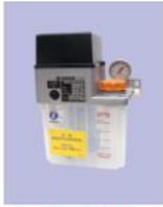
Japan SHOWA oiler SMC