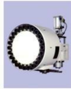
Frequency conversion tool magazine