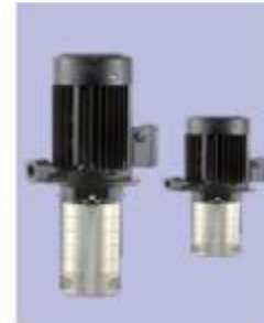
Double water pump system 55 meters lift