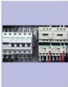
Schneider Electric Components