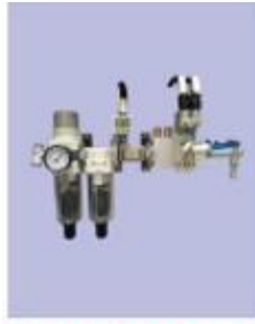
Yede kind gas source treatment device