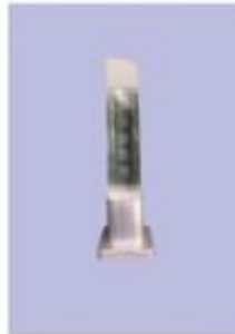
Gaogao LED warning light with peak beep